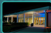
Benson Student Center a glow to teal lights for Occipital Neuralgia awareness